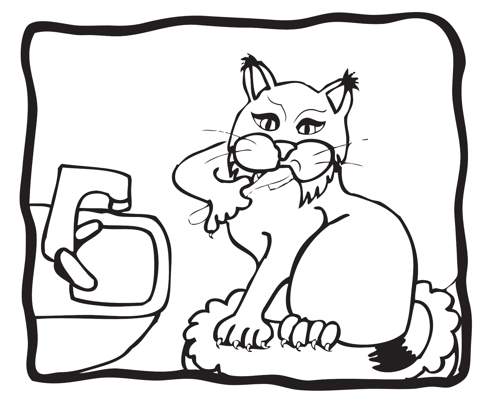
Don't let water gush;

Slow, Slow, Slow your flow, catch our precious rain. It's barrels of fun; the cost hardly none. We've got everything to gain.